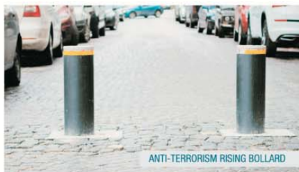
ANTI-TERRORISM RISING BOLLARD