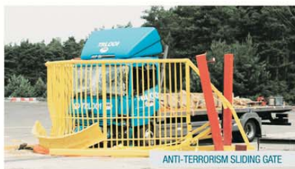
ANTI-TERRORISM SLIDING GATE