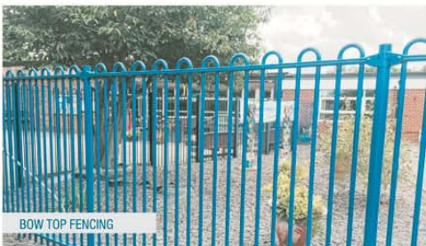
BOW TOP FENCING