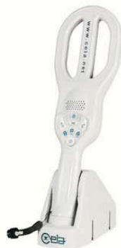
ANTI-TERRORISM METAL DETECTORS