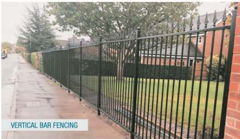
VERTICAL BAR FENCING